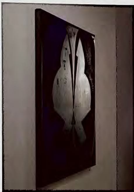
Nathlie Provosty Miran, 2012

present exhibition lies in their ability to reach across time, materials, and borders. ■