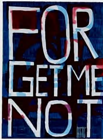
EJ Hauser forgetmenot , 2012