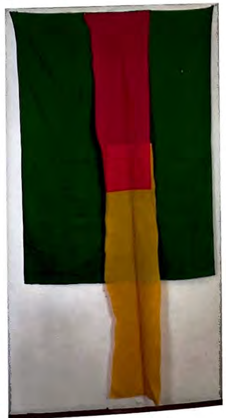
Joe Fyfe TALAT SAO , 2011