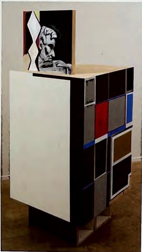
Pam Lins Lincoln Bookend Obstruction , 2010

Eating these delights in a local coffee shop, we (the curators) came to realize that our conversations about art and these hybrid pastries were related. Planning Donut Muffin , we had conversations with artists approaching painting from a sculptural perspective. We discussed sculpture as drawing, and light as painting. We came to realize that in contrast to the orthodoxy of Modernist and subsequent postmodern practices, these artists embrace porous and iterative approaches to art-making, and in so doing, acknowledge the ever-shifting experience of the viewer. We saw the studio and talismans of everyday life folded into formal practices of painting and sculpture. Hierarchies of art objecthood and materiality were being challenged. Above all, we found the