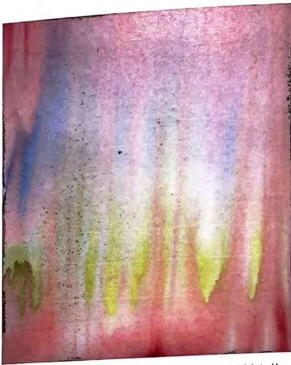
Stephen Truax I never knew a man could tell so many lies (detail), 2012

ing, and sum up to create an “obstruction” within the space of the gallery. It is as if what was once a demure object on a pedestal blocking a path towards a painting is now a linebacker holding ground for sculpture.