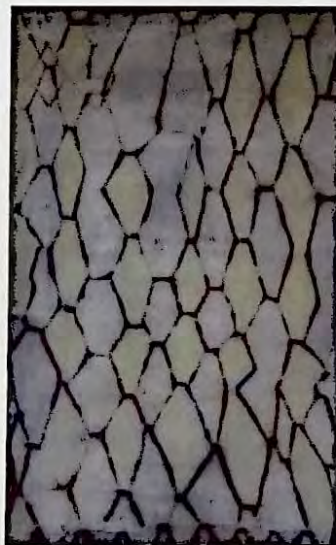
Clinton King Confetti you make me cry , 2012

role of memory and perception, the subjective and emotional aspects of art-making and experiencing art, at the forefront of discussions about their bodies of work. This last alchemic piece encompasses the attitude and position of Donut Muffin : transcending two worlds through unification of seemingly contradictory camps—painting and sculpture, conceptual and intuitive, the space between intention and perception.