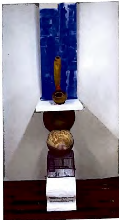
Robert Rhee Second Bird of Passage , 2012

Rhee's Wind Egg gourd sculptures are evocative of ancient ritual and common use. Some are embellished with jewels, sport light bulbs, or are adorned with rich painterly swashes of color. Like a steampunk Brancusi, the work is at once familiar and alien. Rhee's practice deploys formal historic motifs of sculpture, such as the totemic forms of Second Bird of Passage , and the Arp-like forms of the Wind Eggs . They simultaneously engage in deliberately impermanent materials, such as the gourds themselves, that relate to folk and craft applications.